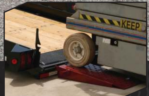
The "SL" (Scissor Lift) option includes ramps to lower the loading incline.