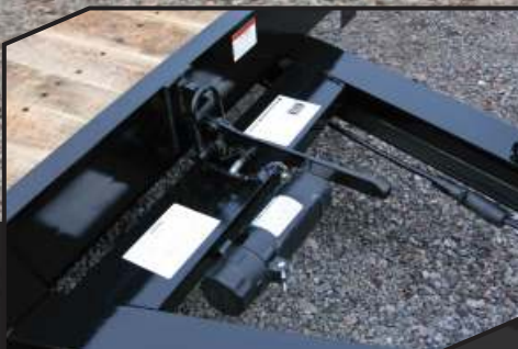
Positive locking (over-center) latch system keeps deck secured to the frame.