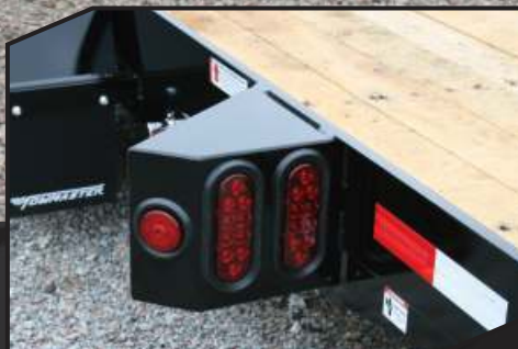
Grommet mounted LED lights are standard.