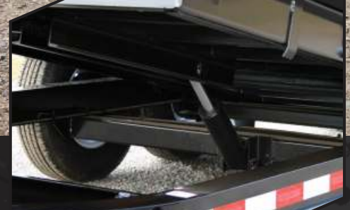
Cushion cylinder controls the deck when loading or unloading equipment.