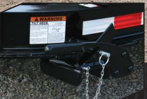
Single deck latch lever with dual latch securement is easy to operate.