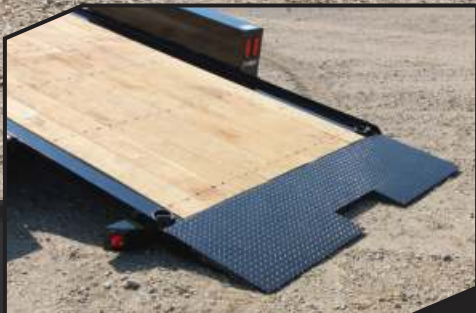
Long approach ramp allows easy equipment loading and unloading.